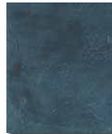
Slate Blue VP4010