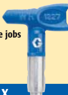
RAC X WideRAC ™ SwitchTips

24 in (61 cm) fan pattern! Complete jobs in half the time!