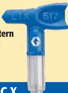
RAC X SwitchTips

Longest lasting fan pattern on the market!