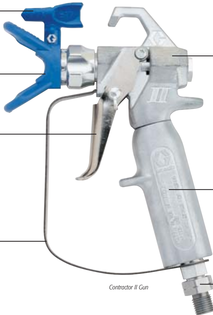
Contractor II Gun