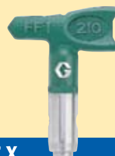
RAC X Fine Finish SwitchTips

Provides the highest quality finish for all of your Fine Finish applications