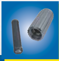
High pressure filter threads on the inside - prevents damage.