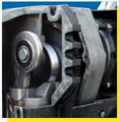
Sturdy ball bearing supported crankshaft.