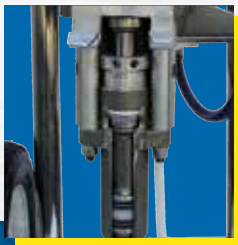
SL pump handles heavy coatings like elastomerics.