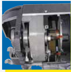
Toothed belt motor drive needs no maintenance .