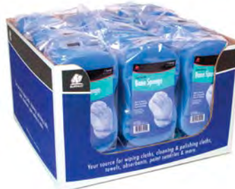
Bone Sponge Counter Display Box