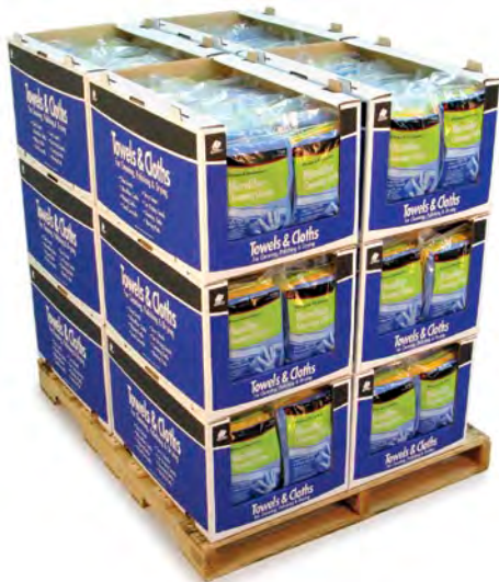
Microfiber 12 Pack Bags Full Pallet Display

HALF Pallet Dimensions: 42" wide x 50" high x 24" deep