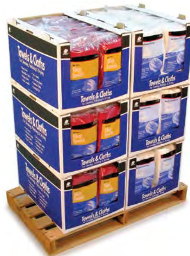
Shop 25 Pack Bags / Terry 12 Pack Bags Split Half Pallet Display