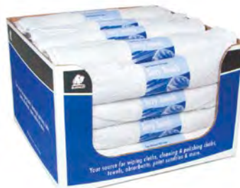
Terry Towel 3 Pack Rolls Counter Display Box

Pre-packed counter display boxes for convenient merchandising. Also fit well on base decks. Please check out our web site for the complete list of items offered in the counter display box. Counter Display Box Dimensions: 15.75" wide x 10" high x 15.75" deep