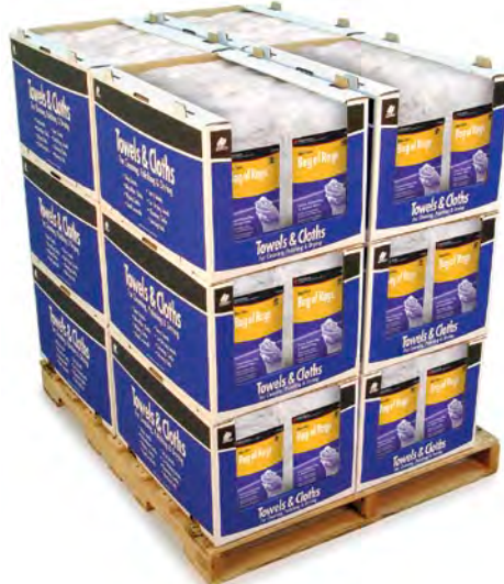
White T-Shirt Rags 4 Pound Bags Full Pallet Display