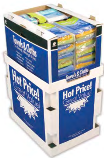
Assortment of Marine Products Great Value Floor Display

Convenient, self-standing, pre-packed floor displays offered in a variety of combinations. Excellent off-shelf merchandiser. Please check out our web site for the complete list of items offered in the Great Value Floor Display. Great Value Floor Display Dimensions: 19" wide x 37" high x 26" deep