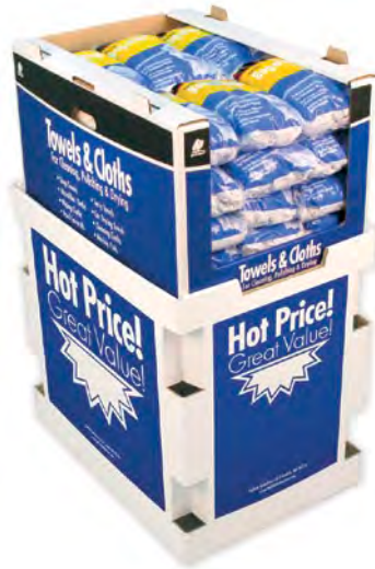
Recycled White T-Shirts 1 Lb. Bags Great Value Floor Display