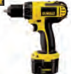
DC742KA DEWALT COMPACT 3/8" (10MM) 12V CORDLESS DRILL/DRIVER KIT • Tool weight: 3.8 lbs • Battery size: 12V • Chuck size: 3/8" • Speed: 0 to 400 / 0 to 1450 RPM • Sku:5130450