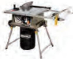
RK7241S 10" TABLE SAW W/ LASER • Motor size: 15 AMP • Blade size: 10" • Sku:7102739