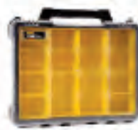
014461M FATMAX PRO XL ORGANIZER Unique lid design keeps storage cups locked in place. Sku: 5070066