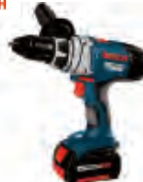
DDH181-01 18V BRUTE TOUGH DRILL DRIVER W/2 3.0AH HC BATTERIES • Tool weight: 4.7 lbs • Battery size: 18V • Chuck size: 1/2" • Speed: 0 to 380 / 0 to 1,600 • Sku:9915532