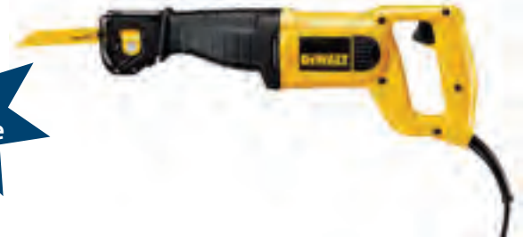
DW304PK DEWALT 10AMP 4 POSITION HEAVY DUTY KEYLESS RECIPROCATING SAW • Tool weight: 7 lbs • Sku:1314971