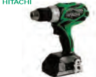
DS18DSAL 18V 1/2" DRILL / DRIVER • Tool weight: 3.3 lbs • Battery size: 18V • Chuck size: 1/2" • Speed: 0 to 1,500 RPM • Sku:1443186