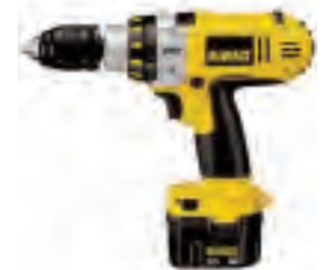
DCD910KX DEWALT 12V XRP DRILL/DRIVER KIT • Tool weight: 5.2 lbs • Battery size: 12V • Chuck size: 1/2" • Speed: 0 to 425 / 0 to 1,200 / 0 to 1,800 RPM • Sku:1309013