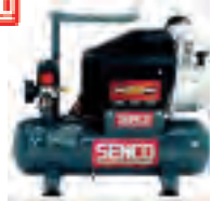
PC1130 1.5 HP ELECTRIC COMPRESSOR

• Tool weight: 39 lbs • Tank size: 2.5 gal • Sku:6523285