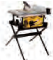
DWE7490X 10" JOBSITE TABLE SAW W/SCISSOR STAND • Motor size: 15 AMP • Blade size: 10" • Sku:5133131