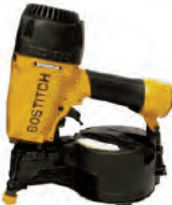
N66C-1 COIL SIDING NAILER (INCLUDES GLOVE) • Tool weight: 4.7 lbs • Fastener range: 1-1/4" to 2-1/2" 15 degree coil siding and plastic inserted siding nails • Sku:3552616