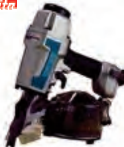
AN611 2-1/2" COIL SIDING NAILER • Tool weight: 6.1 lbs • Fastener length: 1-1/4" to 2-1/2", .080" to .099" diameter • Sku:1070011