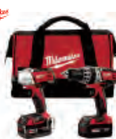
2697-22 M18 HAMMER DRILL W/IMPACT DRIVER Sku:1131176 Includes: (1) 2607-20 hammer drill, tool weight: 3 lbs, battery size: 18V, chuck size: 1/2", speed: 0-400/0-1,000RPM; (1) 2656-20 impact driver, tool weight: 3.1 lbs, battery size: 18V, chuck size: 1/4", speed: 0-2750RPM; (2) battery pack; (1) charger; (1) contractor bag