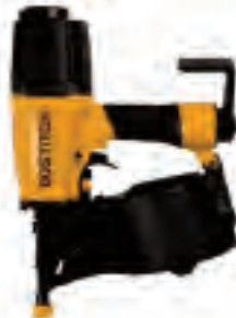
N75C-1 COIL SHEATHING NAILER • Tool weight: 5.2 lbs • Fastener range: 1-1/2" to 3" 15-degree coil framing and plastic inserted siding nails • Sku:3551342