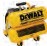
D55151 DEWALT HEAVY-DUTY 1.1HP CONTINUOUS 4 GAL ELEC HAND CARRY COMPRESSOR

• Tool weight: 53.32 lbs • Tank size: 4gal twin stack tank • Sku:5131341