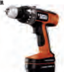
SS12C 12V SMART SELECT DRILL • Tool weight: 5 lbs • Battery size: 12V • Chuck size: 3/8" • Speed: 0 to 400 / 0 to 1,200 RPM • Sku:5124069