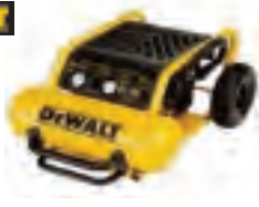
D55146 DEWALT 1.6HP CONTINUOUS 200PSI 4.5GAL COMPRESSOR

• Tool weight: 83 lbs • Tank size: 4.5 gal • Sku:3554147