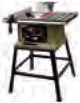
RK7240.1 13AMP 10" PORTABLE TABLE SAW W/LEG STAND • Motor size: 13 AMP • Blade size: 10" • Sku:7100132