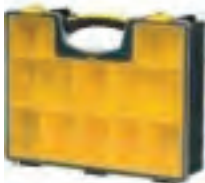
014710R 10 COMPARTMENT PROFESSIONAL ORGANIZER Unique lid design keeps storage cups locked in place. Sku: 5070058