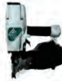
NV75AG 1-3/4" - 3" MULTI PURPOSE NAILER • Tool Weight: 5.5 lbs • Fastener Length: 1-3/4" to 3" • Sku:1421051