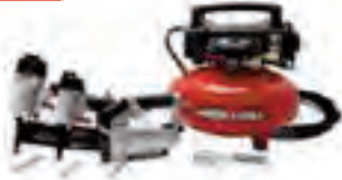
PCFP12234 FINISH NAILER / BRAD NAILER / STAPLER COMPRESSOR COMBO KIT