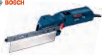
1640VS BOSCH FINE CUT POWER HANDSAW(SAW ONLY) • Tool weight: 5.2 lbs • Sku:9913297