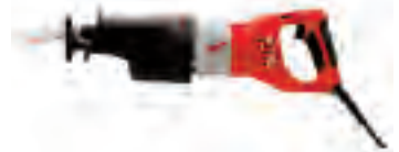
6538-21 15AMP SUPER SAWZALL • Tool weight: 9.8 lbs • Sku:1123017 Includes: (1) 6538-21 15-amp super sawzall reciprocating saw, (1) carrying case