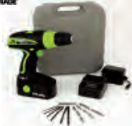
840051 KAWASAKI 19.2V CORDLESS DRILL / DRIVER • Tool weight: 7.15 lbs • Battery size: 19.2V • Chuck size: 3/8" • Speed: 1,100 RPM • Sku:5010101