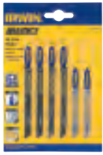
3072001 6 PC ASST JIG SAW BLADE T-SHANK SET Sku:6527094