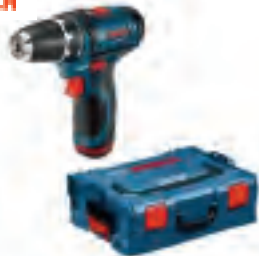
PS31-2AL BOSCH 12V MAX CORDLESS LITHIUM-ION 3/8" DRILL DRIVER W/L-BOXX • Tool weight: 2.14 lbs • Battery size: 12V • Chuck size: 3/8" • Speed: 0 to 1,300 RPM • Sku:9916296