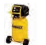
D55168 DEWALT 1.6HP CONTINUOUS 200PSI 15GAL WHEELED WORKSHOP COMPRESSOR

• Tool weight: 92 lbs • Tank size: 15 gal • Sku:3554082