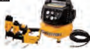
BTFP72646 3 TOOL COMPRESSOR COMBO KIT