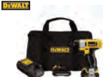
DCF610S2 DEWALT 1/4" 12V MAX CORDLESS SCREWDRIVER KIT • Tool weight: 2.2 lbs • Battery size: 12V • Chuck size: 1/4" • Speed: 0 to 1,050 RPM • Sku:5131804