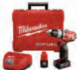
2403-22 M12 FUEL 1/2" DRILL/ DRIVER KIT • Tool weight: 1.6 lbs • Battery size: 12V • Chuck size: 1/2" • Speed: 0 to 450 / 0 to 1,700 RPM • Sku:1129791