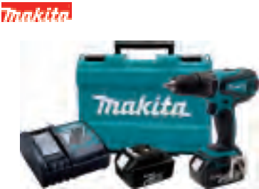
LXPH01 18V LXT LITHIUM-ION CORDLESS 1/2" HAMMER DRIVER-DRILL KIT • Tool weight: 4 lbs • Battery size: 18V • Chuck size: 1/2" • Speed: 0 to 400 / 0 to 1,500 RPM • Sku:1006479