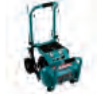
MAC5200 3.0HP 5.2 GAL OIL-LUBRICATED COMPRESSOR

• Tool weight: 88 lbs • Tank size: 5.2 gal • Sku:1004638