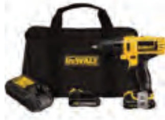
DCD710S2 DEWALT 3/8" 12V MAX CORDLESS DRILL / DRIVER KIT • Tool weight: 2.4 lbs • Battery size: 12V • Chuck size: 3/8" • Speed: 1,500 RPM • Sku:5131839