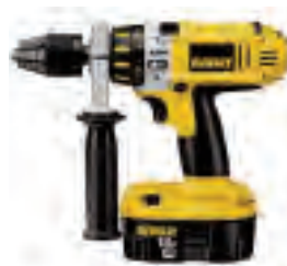
DCD950KX DEWALT 18V XRP MID HANDLE HAMMERDRILL/ DRIVER KIT • Tool weight: 6.2 lbs • Battery size: 18V • Chuck size: 1/2" • Speed: 0 to 500 / 0 to 1,250 / 0 to 2,000 RPM • Sku:5151295