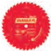
D1040A DIABLO 10" X 40T GENERAL PURPOSE/MITER BLADE Sku:1354256