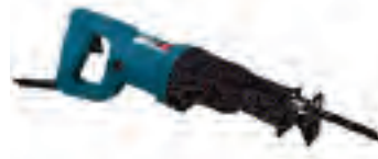
JR3050T RECIPROCATING SAW (JR3000VX1 W/M FORCE GLOVES) • Tool weight: 7.1 lbs • Sku:6111114 Includes: tool case (824734-9), blade (723054-A), blade (723066-A)