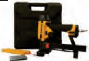
SL1838BC BOSTITCH CAP STAPLER • Tool weight: 3.9lbs • Fastener range: 1" to 1-1/2", 5/16" crown staples & caps • Sku:3553779