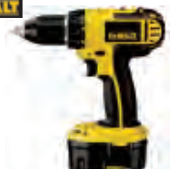
DC730KA DEWALT COMPACT 1/2" (13MM) 14.4V CORDLESS DRILL/DRIVER KIT • Tool weight: 4.3 lbs • Battery size: 14.4V • Chuck size: 1/2" • Speed: 0 to 400 / 0 to 1,450 RPM • Sku:5130468