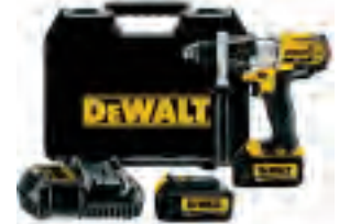
DCD980M2 20V MAX LITHIUM ION PREMIUM 3SP DRILL/ DRIVER KIT • Tool weight: 11.6 lbs. • Batter size: 20V • Chuck size: 1/2" • Speed: 0 to 575 / 0 to 1,350 / 0 to 2,000 RPM • Sku:5132223