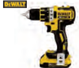
DCD790D2 20V MAX COMPACT BL DRILL / DRIVER KIT • Tool weight: 3.5 lbs • Battery size: 20V • Chuck size: 1/2" • Speed: 0 to 600 / 0 to 2,000 RPM • Sku:5133009