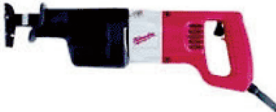
6509-31 12 AMP SAWZALL RECIP SAW • Tool weight: 11.9 lbs • Sku:1137832