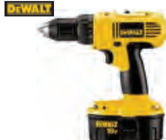
DC759KA DEWALT 18V 1/2" COMPACT CORDLESS DRILL/DRIVER • Tool weight: 5.2 lbs • Battery size: 18V • Chuck size: 1/2" • Speed: 0 to 450 / 0 to 1,500 RPM • Sku:5131201