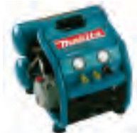
MAC2400 2.5HP 4.2 GAL TWIN STACK OIL-LUBRICATED COMPRESSOR

• Tool weight: 77 lbs • Tank size: 4.2 gal • Sku:1004620