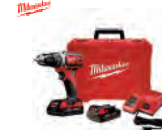
2606-22CT M18 1/2" COMPACT DRILL/DRIVER KIT • Tool weight: 9.4 lbs • Battery size: 18V • Chuck size: 1/2" • Speed: 0 to 1,800 RPM • Sku:1129775