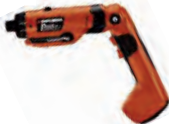
PD600 6V ALL IN 1 DRILL/DRIVER PIVOT PLUS • Tool weight: 2.8 lbs • Battery size: 6V • Chuck size: 1/4" • Speed: 600 RPM • Sku:7272901