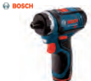
PS21-2A BOSCH 12V MAX POCKET DRIVER W/2 BATTERIES • Tool weight: 1.12 lbs • Battery size: 12V • Chuck size: 1/4" • Speed: 0 to 350 / 0 to 1,300 RPM • Sku:9916288