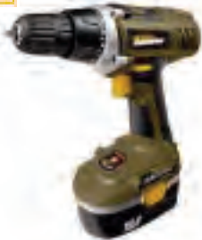
RC2804K2 18V 3/8" CORDLESS DRILL/DRIVER KIT (2) BATTERIES • Tool weight: 8 lbs • Battery size: 18V • Chuck size: 3/8" • Speed: 0-600 RPM • Sku:7101279