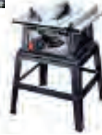
GTS10SB 10" 15 AMP TABLE SAW W/STAND • Motor size: 15 AMP • Blade size: 10" • Sku:7114044