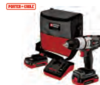
PCL180CDK-2 18V LITHIUM DRILL/DRIVER • Tool weight: 3.8 lbs • Battery size: 18V • Chuck size: 1/2" • Speed: 0 to 350 / 0 to 1,500 RPM • Sku:1179705