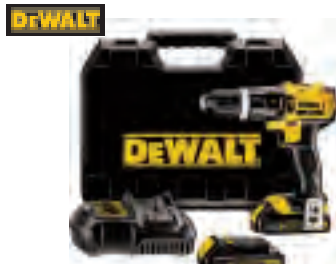
DCD785C2 20V MAX LI-ION COMPACT HAMMERDRILL / DRIVER KIT 1.5AH • Tool weight: 3.5 lbs • Battery size: 20V • Chuck size: 1/2" • Speed: 0-600 / 0 to 2000 RPM • Sku:5132215