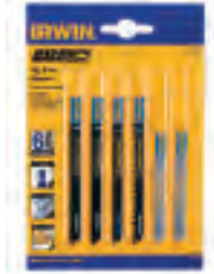
3071001 6 PC ASST JIG SAW BLADE U-SHANK SET Sku:6527086