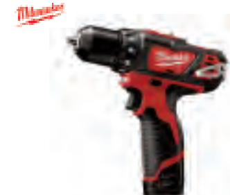
2407-22 M12 3/8" DRILL/DRIVER KIT • Tool weight: 2.5 lbs • Battery size: 12V • Chuck size: 3/8" • Speed: 0 to 400 / 0 to 1,500 RPM • Sku:1123297