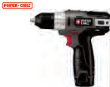
PCL120DDC-2 PORTER CABLE 12V MAX COMPACT LITHIUM 3/8" DRILL / DRIVER • Tool weight: 2.4 lbs • Battery size: 12V • Chuck size: 3/8" • Speed: 0 to 315 / 0 to 1,200 RPM • Sku:1182722