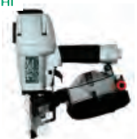
NV65AH COIL SIDING NAILER • Tool Weight: 4.6 lbs • Fastener length: 1-1/2" to 2-1/2" • Drives wire and plastic sheet collated nails for added flexibility • Sku:1420330