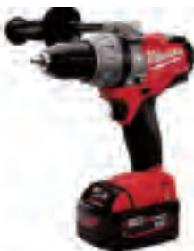
2604-22 M18 FUEL 1/2" COMPACT HAMMER DRILL KIT W/XC BATTERIES • Tool weight: 13.1 lbs • Battery size: 18V • Chuck size: 1/2" • Speed: 0 to 1,850 RPM • Sku:1128329