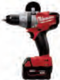
2603-22 M18 FUEL 1/2" COMPACT DRILL KIT W/XC BATTERIES • Tool weight: 4.9 lbs • Battery size: 18V • Chuck size: 1/2" • Speed: 0 to 550 / 0 to 1,850 RPM • Sku:1128311