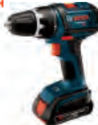
DDS181-02L 18V COMPACT TOUGH 1/2" DRILL/DRIVER • Tool weight: 12 lbs • Battery size: 18V • Chuck size: 1/2" • Speed: 0 to 1,700 RPM • Sku:9916717