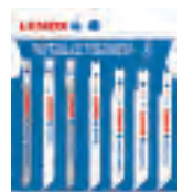
20606-U743JA 7 PC JIG SAW BLADE SET U-SHANK • Sku:1060392