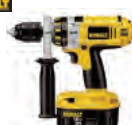
DCD940KX DEWALT 18V CORDLESS XRP DRILL / DRIVER KIT • Tool weight: 6.25 lbs • Battery size: 18V • Chuck Size: 1/2" • Speed: 0 to 400 / 0 to 1,500 RPM • Sku:5130379