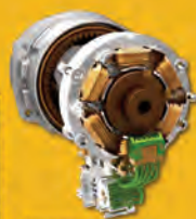
Brushless Motor Electronically controls energy transfer efficiently within the tool. This allows the tool to run longer between charges.

BRUSHLESS MOTORS UP TO 57% MORE RUNTIME Versus Standard Brushed Motors