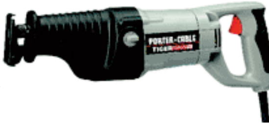
9748 11.5AMP VS DUAL ACTION QUIK-CHANGE RECIP TIGER SAW • Tool weight: 9.3 lbs • Sku:1277014