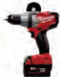
2603-22CT M18 FUEL 1/2" COMPACT DRILL KIT • Tool weight: 4.4 lbs • Battery size: 18V • Chuck size: 1/2" • Speed: 0 to 550 / 0 to 1,850 RPM • Sku:1128302