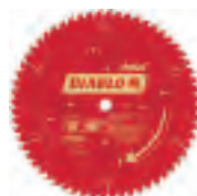
D1060X DIABLO 10" X 60T FINE FINISH BLADE CARVED Sku:6998941