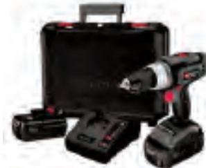
PC180DK-2 18V NICAD DRILL • Tool weight: 5.1 lbs • Battery size: 18V • Chuck size: 1/2" • Speed: 1,400 RPM • Sku:1179691