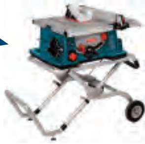
0601B13110 BOSCH 10" PORTABLE TABLE SAW W/TS3000 GRAVITY RISE STAND • Motor size: 15 AMP • Blade size: 10" • Sku:9914200