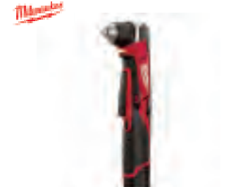
2415-21 M12 CORDLESS RIGHT ANGLE DRILL / DRIVER KIT • Tool weight: 2.4 lbs • Battery size: 12V • Chuck size: 3/8" • Speed: 0 to 800 RPM • Sku:1123602