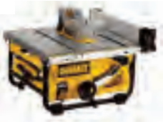
DWE7480 10" COMPACT JOBSITE TABLE SAW W/SITE-PRO MODULAR GUARDING SYSTEM • Motor size: 15 AMP • Blade size: 10" • Sku:5133122