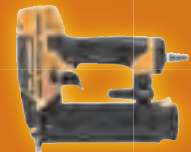
18 GA Brad Nailer BTFP12233

Smart Point™ nailers feature smaller noses* and eliminate the need to compress the contact trip to actuate the tools, reducing work surface damage and the risk of pushing the material out of position.