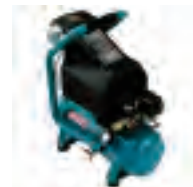
MAC700 2.0HP 2.6 GAL OIL-LUBRICATED COMPRESSOR

• Tool weight: 52 lbs • Tank size: 2.6 gal • Sku:1004611