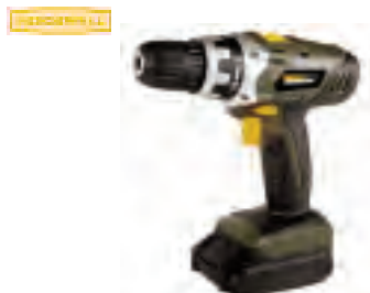
SS2800 SHOPSERIES 18V LITHIUM DRILL W/ONE BATTERY • Tool weight: 4 lbs • Battery size: 18V • Chuck size: 3/8" • Speed: 0 to 1,200 RPM • Sku:7106084