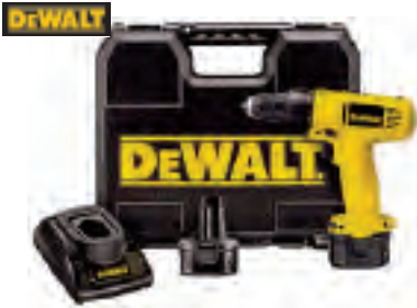
DC750KA DEWALT 9.6V COMPACT 3/8" CORDLESS DRILL KIT • Tool weight: 3.4 lbs • Battery size: 9.6V • Chuck size: 3/8" • Speed: 0 to 300 / 0 to 1,100 RPM • Sku:5149487