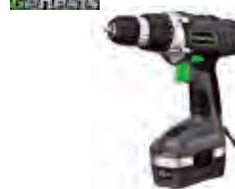
GCD18BK 18V VSR DRILL/DRIVER KIT • Tool weight: 3.4 lbs • Battery size: 18V • Chuck size: 3/8" • Speed: 0-550 RPM • Sku:7113901