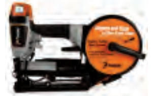
502575 CS150 CAP STAPLER • Tool Weight: 4.8 lbs • Fastener range: 3/4" to 1-1/2", 18ga, 3/8" crown staples • Sku:1182153