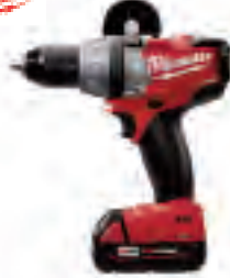
2604-22CT M18 FUEL 1/2" COMPACT HAMMER DRILL KIT • Tool weight: 10.8 lbs • Battery size: 18V • Chuck size: 1/2" • Speed: 0 to 550 / 0 to 1,850 RPM • Sku:1128337