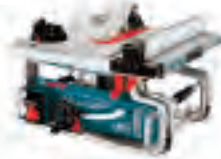
GTS1031 BOSCH 10" PORTABLE TABLE SAW • Motor size: 15 AMP • Blade size: 10" • Sku:9916423