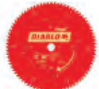
D1280X DIABLO 12" X 80T FINE FINISH BLADE CARVED Sku:6999069