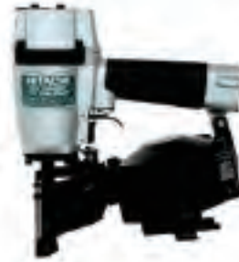
NV45AB2 COIL ROOFING NAILER • Tool Weight: 5.5 lbs • Fastener Length: 7/8" to 1-3/4" • Sku:1421042