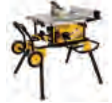
DWE7491RS 10" JOBSITE TABLE SAW 32 - 1/2" 82.5CM RIP CAPACITY & ROLLING STAND • Motor size: 15 AMP • Blade size: 10" • Sku:5133190