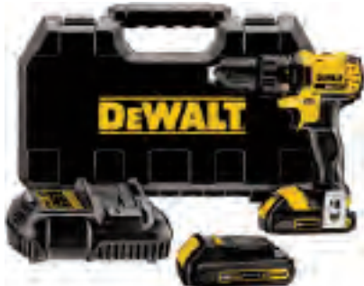
DCD780C2 20V MAX LI-ION COMPACT DRILL / DRIVER KIT 1.5AH • Tool weight: 3.4 lbs • Battery size: 20V • Chuck size: 1/2" • Speed: 0 to 600 / 0 to 2,000 RPM • Sku:5132207