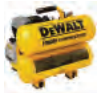
D55153 DEWALT 2HP ELECTRIC 4 GAL TWIN STACK COMPRESSOR

• Tool weight: 56.5 lbs • Tank size: 4gal twin stack tank • Sku:5151317