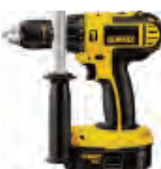
DC725KA DEWALT COMPACT 1/2" (13MM) 18V CORDLESS HAMMERDRILL KIT • Tool weight: 4.9 lbs • Battery size: 18V • Chuck size: 1/2" • Speed: 0 to 500 / 0 to 1,700 RPM • Sku:5130611