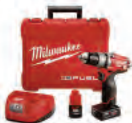
2404-22 M12 FUEL 1/2" HAMMER DRILL/DRIVER KIT • Tool weight: 2.6 lbs. • Battery size: 12V • Chuck size: 1/2" • Speed: 0 to 1,700 RPM • Sku:1129961