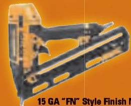
15 GA "FN" Style Finish Nailer BTFP72156 or 15 GA "DA" Style Finish Nailer BTFP72155