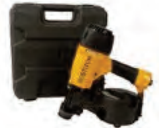
N66BC-1 CAP NAILER • Tool Weight: 5.8 lbs • Fastener range: 1-1/4" to 2-1/2" 15 degree coil siding and plastic inserted siding nails, and plastic caps • Sku:3551351