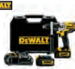
DCD985M2 20V MAX LITHIUM ION PREMIUM 3SP HAMMER-DRILL KIT • Tool weight: 5.2 lbs • Battery size: 20V • Chuck size: 1/2" • Speed: 0 to 575 / 0 to 1,350 / 0 to 2,000 RPM • Sku:5132231