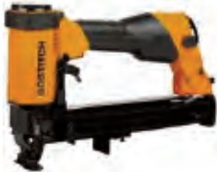
438S2R-1 INDUSTRIAL JAM-FREE ROOFING STAPLER • Tool Weight: 4.7 lbs • Fastener range: 1/2" to 1-1/2" Wide Crown (1") Staples • Sku:3550231