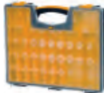
014725R 25 COMPARTMENT ORGANIZER Unique lid design keeps storage cups locked in place. Sku: 5070040