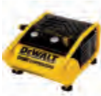
D55140 DEWALT HEAVY DUTY 1 GALLON 135 PSI MAX TRIM COMPRESSOR

• Tool weight: 24 lbs • Tank size: 1 gal • Sku:5130441