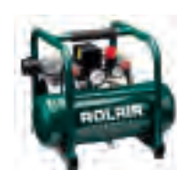
JC10 2.5 GAL 1HP OIL-LESS AIR COMPRESSOR

• Tool weight: 39 lbs • Tank size: 2.5gal • Sku:1185926