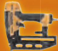
16 GA Finish Nailer BTFP71917