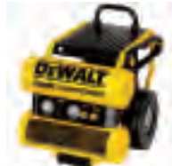
D55154 DEWALT HD 1.1HP CONTINUOUS 4GAL ELEC WHEELED DOLLY-STYLE AIR COMPRESSOR

• Tool weight: 87 lbs • Tank size: 4 gal • Sku:5130522