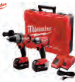
2797-22 M18 FUEL HAMMER DRILL W/IMPACT DRIVER • Tool weight: 17.9 lbs • Battery size: 18V • Sku:1131168 Includes: (1) 2604-20 hammer drill, chuck size: 1/2", speed: 0-1850RPM; (1) 2653-20 impact driver, chuck size: 1/4", speed: 0-2900RPM; (2) M18 battery pack; (1) M18 charger; (1) belt clip, carrying case, and side handle