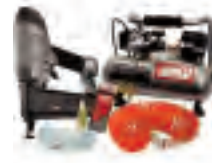
PC0947 COMPRESSOR / NAILER FINISH PRO 18 COMBO KIT