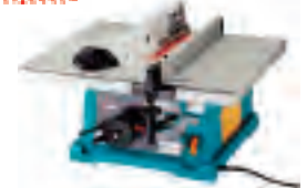
2705 10" TABLE SAW • Motor size: 15 AMP • Blade size: 10" • Sku:1004417