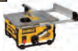
DW745 DEWALT 10" COMPACT JOB SITE TABLE SAW • Motor size: 15 AMP • Blade size: 10" • Sku:5130387