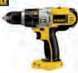
DCD950B DEWALT 1/2" (13MM) 18V XRP HAMMERDRILL/ DRILL/DRIVER (TOOL ONLY) • Tool weight: 3.9 lbs (tool only) • Battery size: 18V • Chuck size: 1/2" • Speed: 0 to 500 / 0 to 1,250 / 0 to 2,000 RPM • Sku:5131669