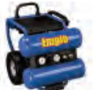
EM810-4M EMGLO HD 4GAL DOLLY STYLE STACKED TANK AIR COMPRESSOR

• Tool weight: 95 lbs • Tank size: 4 gal • Sku:5132177