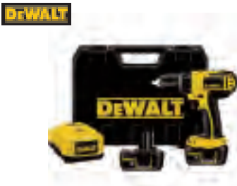
DCD760KL DEWALT 1/2" (13MM) 18V CORDLESS COMPACT LI-ION DRILL/DRIVER KIT • Tool weight: 4 lbs • Battery size: 18V • Chuck size: 1/2" • Speed: 0 to 500 / 0 to 1,700 RPM • Sku:5131791