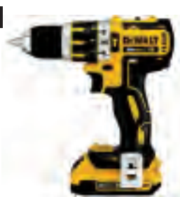
DCD795D2 20V MAX COMPACT BL HAMMER DRILL KIT • Tool weight: 8.9 lbs • Battery size: 20V • Chuck size: 1/2" • Speed: 0 to 2,000 RPM • Sku:5133017