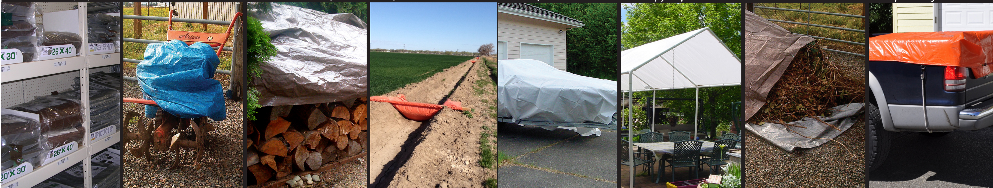
Super Duty Truck