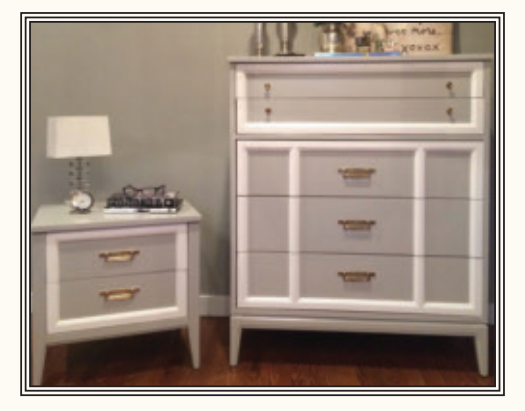
Finshed in Seagull Gray and Snow White Designed by Burlap and Bristles