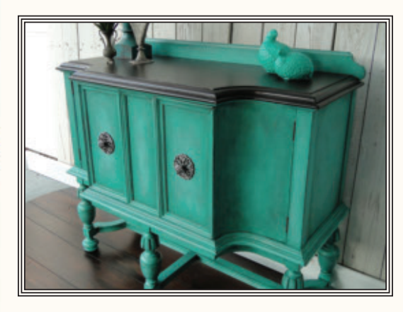
Finished in Patina Green with Winter White Glaze and a Java Gel Stained Top Designed by Modern Vintage

Gel Stains are popular for unfinished wood, up-cycling furniture or restyling existing furniture and cabinets. Wipe-on Gel Stains produce beautiful handrubbed finishes.