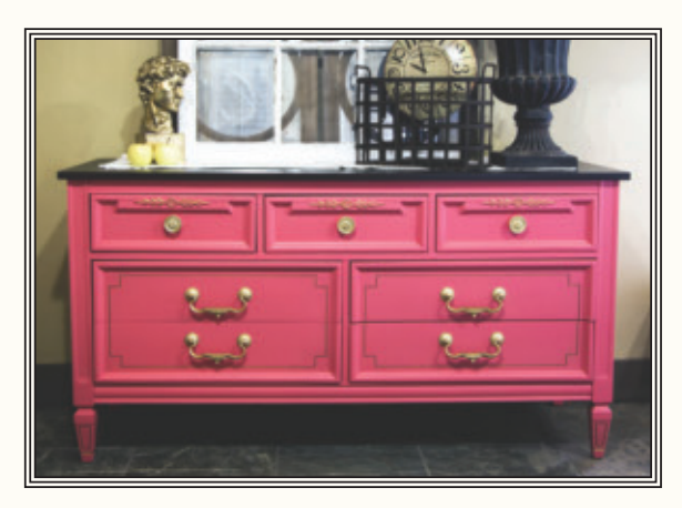
Finished in Coral Crush with a Java Gel Stained Top Designed by Reclaim Relove, Robert & Rose