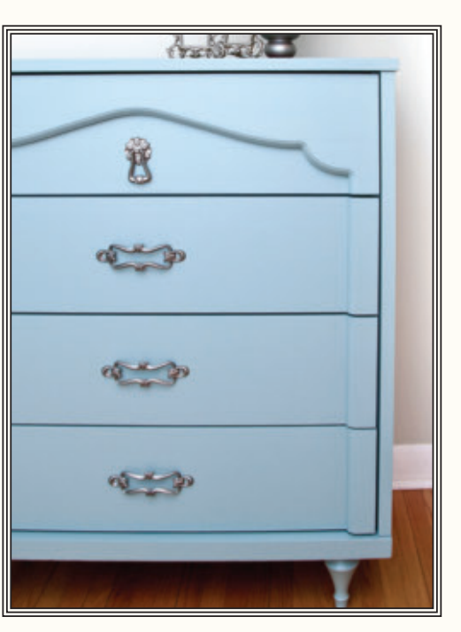
Finished in Persian Blue Designed by Salvaged Inspirations