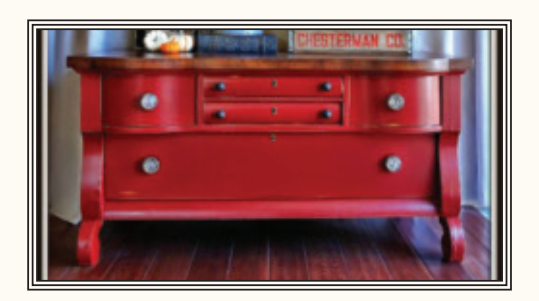
Finshed in Tuscan Red Designed by CreateInspire