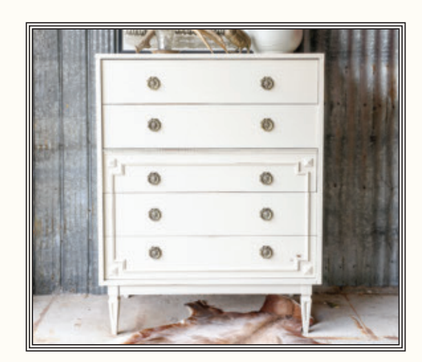
Finished in Linen Designed by Oliver and Rust